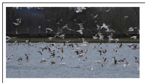
Working with Wadhurst Parish Council to stop a campsite and Yurts being placed next to the gull roost at Bewl Water.

The group is currently working on the following campaigns.