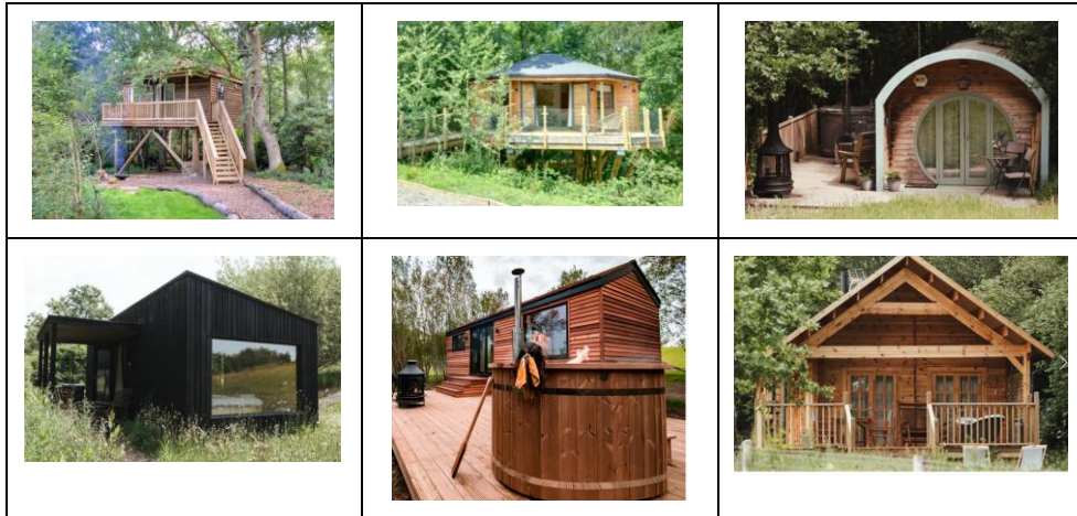
The six existing units